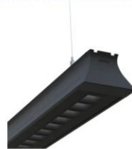
ORIGI SUSPENDED BL